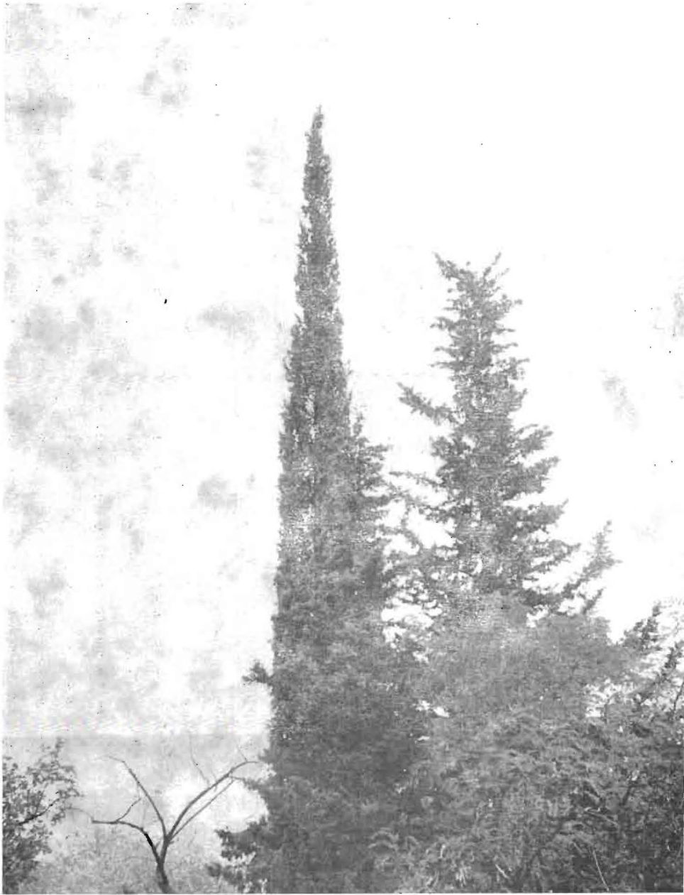
Fig. 1 — Cypress ( Cupressus sempervirens L.) on the graveyard in village Strujići — nesting place of a colony of the Spanish sparrow, Passer hispaniolensis L.